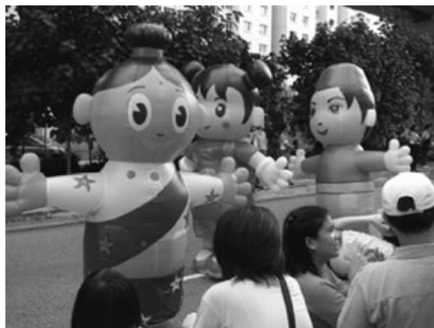
Figure II: Indian, Chinese and Malay dolls at the Racial Harmony Day street carnival in Punggol town, July 2007.

This is made worse by the carnival's emphasis, for the lack of vernacular practices, on skin-deep cultural consumption. Among the ethnic foods given free or sold cheaply at the Punggol carnival, McDonald's hamburgers were the most popular in 2007 and Middle-Eastern kebab wraps in 2008, and in the queue for these foods, Chinese, Malay and Indian families waited, without interacting, for their turn in the marketplace. In this new mode of consumptive capitalism in the 'heartland', the interactive pluralism of Chingay's nation-work teeters and threatens to become the old fragmented pluralism of the colonial era.